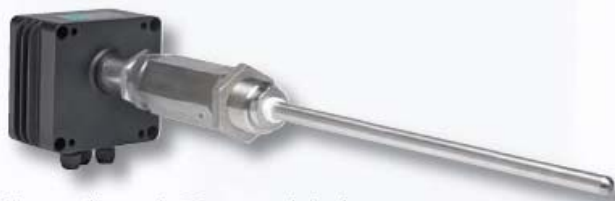
Electrodynamic Sensor with air purge

Monitoring of filters is performed by electrodynamic particle monitors, a revolutionary new design of analytic instruments.